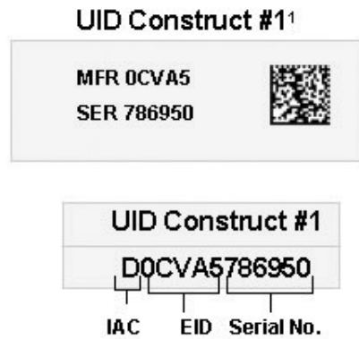
1 This example uses ATA Text Element Identifiers.

Figure 3 shows examples of the data elements and Text Element Identifiers that are placed on the item within the Data Matrix symbol. The ISO/IEC 15434 syntax encoded in the data matrix, using the DD format of the DoD collaborative solution, for Construct #1 would be []>R SDDG SMFR 0CVA5G SSER 786950R S EoT. Available Text Element Identifiers do not permit use of Construct #2. The figure further shows how the AIT devices would output the data elements in a concatenated UID according to the syntax instructions.